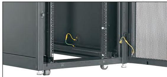
Bonded doors and side panels provide a complete bonded cabinet for protection of equipment and personnel