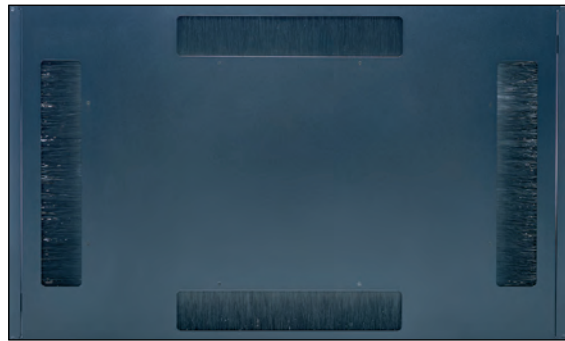
Large brush cable entry minimizes hot air recirculation and allows for large bundles of cables