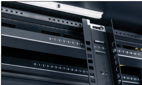
Fully adjustable equipment rails with easy to read horizontal markings offer application flexibility, allowing you to make a network or server cabinet.