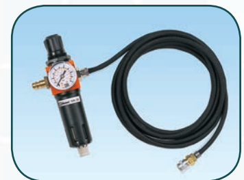
Pneumatic Tool Accessories