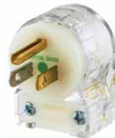
Item #: 7197 Manufacturer: Hubbell Weight: 0.2 lbs

Plug ..... NEMA 5-15 HG Plug Angle..... 8-position Housing Style ..... Insulgrip Voltage..... 125 Volts Amperage..... 15 Amps Ingress Protection ..... IP20 Poles / Wires..... 2p / 3w Cord Grip Range .... .250" - .650" (6.4 - 16.6mm) Color ..... Transparent Certifications ..... UL/cUL Listed, CSA Certified Weight ..... 0.2 lbs