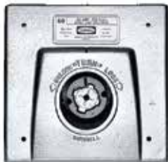
HBL25503 Part Number: BP301911