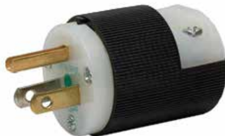
Item #: 7195 Manufacturer: Hubbell Weight: 0.2 lbs

Plug ..... NEMA 5-15 HG Housing Style ..... Insulgrip Voltage..... 125 Volts Amperage..... 15 Amps Ingress Protection ..... IP20 Poles / Wires..... 2p / 3w Cord Grip Range .... .230" - .720" (5.8 - 18.3mm) Color ..... Black/White Certifications ..... UL/cUL Listed, CSA Certified Weight ..... 0.2 lbs