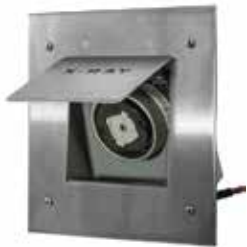
HBL25605 Part Number: BP301910