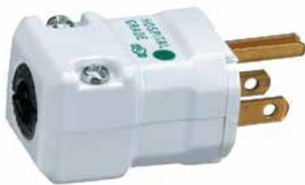
Item #: 7198 Manufacturer: Hubbell Weight: 0.1 lbs

Plug ..... NEMA 5-15 HG Housing Style ..... Valise Voltage..... 125 Volts Amperage..... 15 Amps Ingress Protection ..... IP20 Poles / Wires..... 2p / 3w Cord Grip Range .. .300" - .660" (7.62 - 16.7mm) Color ..... White Certifications ..... UL/cUL Listed, CSA Certified Weight ..... 0.1 lbs