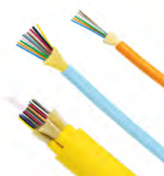
Indoor Distribution Fibre Cable

OM1, OM2, and Outside Plant cables available. Contact Panduit Customer Service or check www.panduit.com for full range.