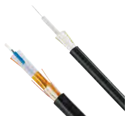
Indoor-Outdoor Fibre Cable